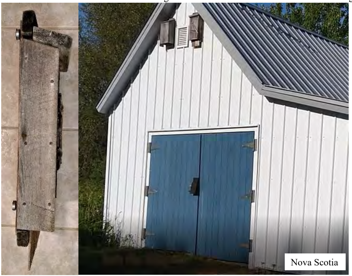
Bat Boxes Across Canada

Side view of one of the bat boxes with magnets and the two boxes mounted on the building.